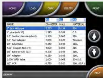
Weld schedule library