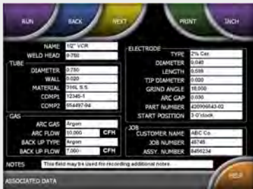
Data entry fields to record all pertinent details

Starting Amps automatically ramp down to Ending Amps during the (365 degree) electrode rotation