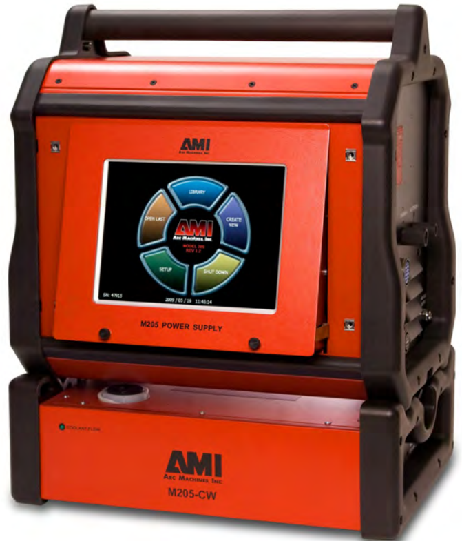
Shown with optional water cooling unit