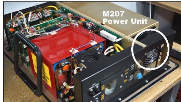
Fig. 3: Dual exhaust fans (circled in top photo) draw air into and out of the M217, providing air flow throughout the interior. The M207 (bottom photo) has a single fan providing direct air flow for the power unit only.