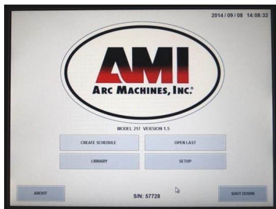
Fig. 5: M217 home screen greets the operator after a 50 second boot-up process. Navigation from here is simple and intuitive.

Hooking up the M217 is simple. Facility requirements are the same as the M207, except the fittings for the purge gas lines are compression style, instead of flared. The unit is switched on with its main breaker, in the same location as the M207. Power-up takes about 50 seconds, and displays the M217 home screen when complete (Figure 5).