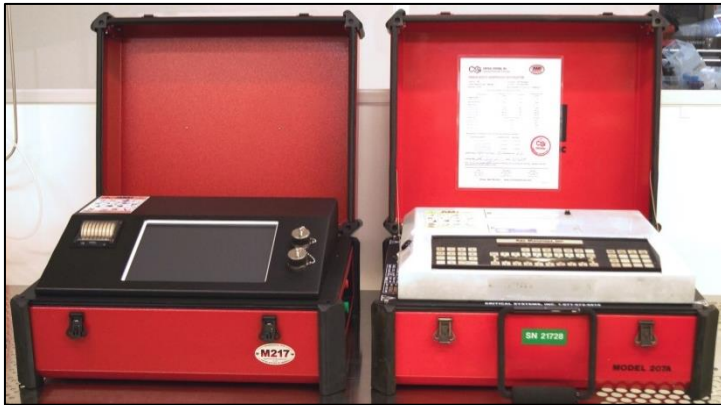
Fig. 1: The footprint of the M217 is the same as the M207, although it is 13 lbs. lighter (66 lbs. vs. 79 lbs.).

The first thing a new user will notice about the M217 is how similar it appears to the M207. The familiar 'red box' has the same foot-print to match up with existing coolers,