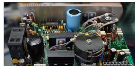
Fig. 4: The M217 has high reliability, modular DC voltage supplies (top photo) vs. the proprietary all-in-one scheme used in the M207 (bottom photo).